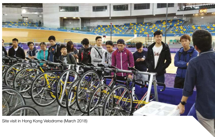
Site visit in Hong Kong Velodrome (March 2018)

The sports and recreation sector is one of the most dynamic industries globally and demand for jobs is high. Many of our students gain graduate based work very soon after graduation. Graduates work in a variety of jobs and for different organisations including commercial and public sector positions. Recent graduates have taken posts within a wide range of fields including: event management, facility management, sport development, sport marketing, sport media, manufacturing and retail, sport coaching and clubhouse management.