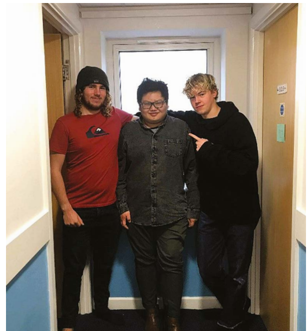
Exchange Programme (2020)

Overseas study opportunities for a full semester will be available for several students to study in Plymouth with all Hong Kong credits being counted toward the qualification. No additional tuition fees will be applied, however, accommodation, flight and other personal expenses will be on the own expenses of students. Financial subsidies may be available, please consult programme staff for more information.