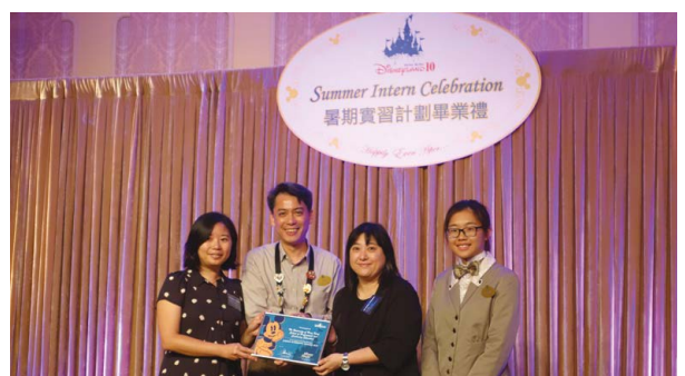
Hong Kong Disneyland Internship Opportunities (Aug 2016)