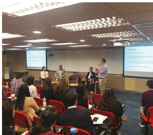
University of Plymouth Day (March 2019)

This events management degree programme aims to develop a range of professional event planning and management knowledge and skills distinctive of an employable, professionally competent international event management practitioner. It develops students' competence in applying appropriate theories and concepts of international event management to practical situations, so that they can be equipped for a career in the festival, event and related service sectors.