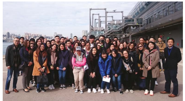
Guided visit to Kai Tak Cruise Terminal (Jan 2018)