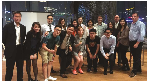
Alumni Night with students and teachers (Sept 2016)