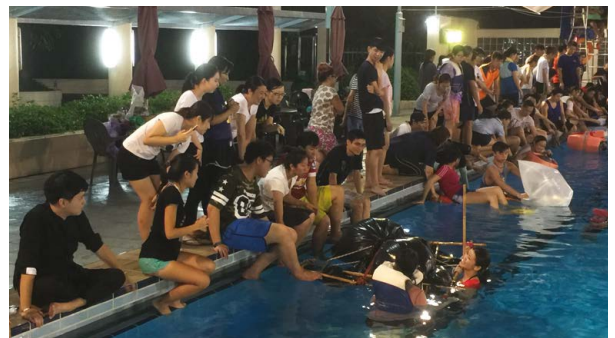
Leadership activity in HKU Flora Ho Sports Centre and Stanley Smith Swimming Pool (Sept 2016)