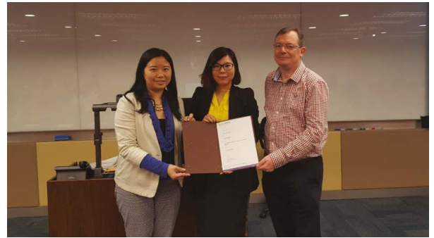
Guest Speaker Talk (March 2019)

“ Building on my previous education on Food Health and Business Management, the degree programme has equipped me with solid and practical knowledge in hospitality management. I learnt a lot from both overseas and local teachers through lectures, class activities and field trips. After graduation, I am very pleased to work in a Michelin-starred French restaurant in an upscale hotel so as to deepen my hospitality knowledge. Since this degree programme is recognized worldwide, I have already planned to pursue a Master degree qualification overseas. ”