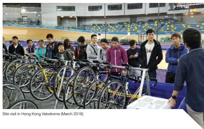
Site visit in Hong Kong Velodrome (March 2018)

The sports and recreation sector is one of the most dynamic industries globally and demand for jobs is high. Many of our students gain graduate based work very soon after graduation. Graduates work in a variety of jobs and for different organisations including commercial and public sector positions. Recent graduates have taken posts within a wide range of fields including: event management, facility management, sport development, sport marketing, sport media, manufacturing and retail, sport coaching and clubhouse management.