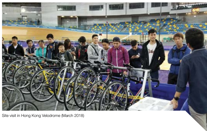
Site visit in Hong Kong Velodrome (March 2018)

The sports and recreation sector is one of the most dynamic industries globally and demand for jobs is high. Many of our students gain graduate based work very soon after graduation. Graduates work in a variety of jobs and for different organisations including commercial and public sector positions. Recent graduates have taken posts within a wide range of fields including: event management, facility management, sport development, sport marketing, sport media, manufacturing and retail, sport coaching and clubhouse management.