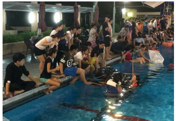
Leadership activity in HKU Flora Ho Sports Centre and Stanley Smith Swimming Pool (Sept 2016)