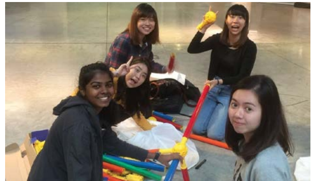
Plymouth Summer School Programme (Aug 2016)

Students will have a valuable opportunity to take part in the summer school course organised by the University of Plymouth for two or four weeks in July/August so as to improve their English communication skills, meet people from around the world, and experience school life in Plymouth. This summer school is optional and its costs are additional to the programme's tuition fee.