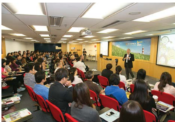
Plymouth University Open Day (Nov 2014)

This hospitality management degree programme is designed to provide a strong vocational theme relevant for a wide range of employment sectors in the hospitality industry. Hospitality embraces a wide range of sectors including: contract catering, hotels, leisure (such as theatres and casinos), licensed retail (pubs and clubs), restaurants and welfare catering. Hospitality continues to be one of the largest growth industries. Its successful management depends on high-quality business skills and the ability to provide consumer satisfaction. This programme aims to equip students with appropriate knowledge and understanding of hospitality and to develop their skills needed for employment or further study.