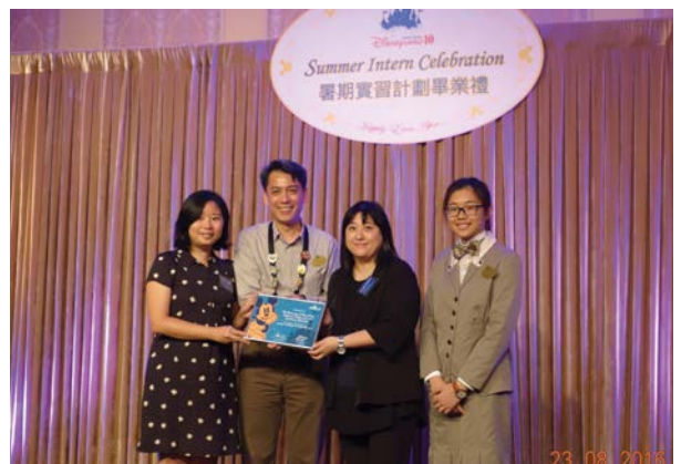
Hong Kong Disneyland Internship Opportunities (Aug 2016)