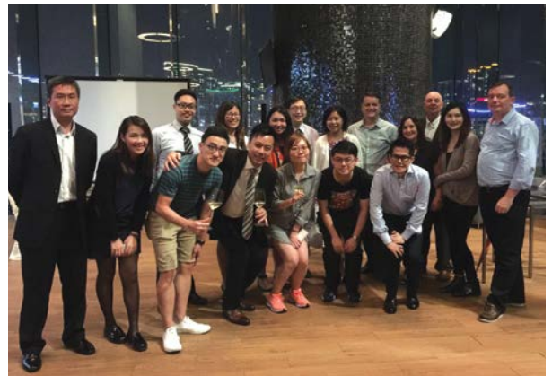
Alumni Night with students and teachers (Sept 2016)