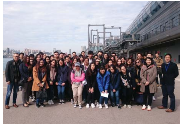
Guided visit to Kai Tak Cruise Terminal (Jan 2018)

“ Academics from Plymouth University and International College are very experienced and knowledgeable in the field of tourism and hospitality. I enjoyed the learning process of the Honours Project as it is a challenging one. ”