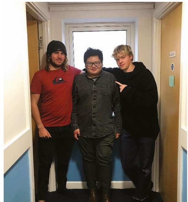
Exchange Programme (2020)

Overseas study opportunities for a full semester will be available for several students to study in Plymouth with all Hong Kong credits being counted toward the qualification. No additional tuition fees will be applied, however, accommodation, flight and other personal expenses will be on the own expenses of students. Financial subsidies may be available, please consult programme staff for more information.