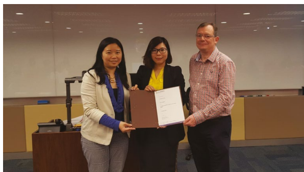
Guest Speaker Talk (March 2019)

“ Building on my previous education on Food Health and Business Management, the degree programme has equipped me with solid and practical knowledge in hospitality management. I learnt a lot from both overseas and local teachers through lectures, class activities and field trips. After graduation, I am very pleased to work in a Michelin-starred French restaurant in an upscale hotel so as to deepen my hospitality knowledge. Since this degree programme is recognized worldwide, I have already planned to pursue a Master degree qualification overseas.”