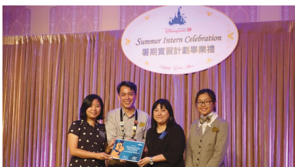
Hong Kong Disneyland Internship Opportunities (Aug 2016)