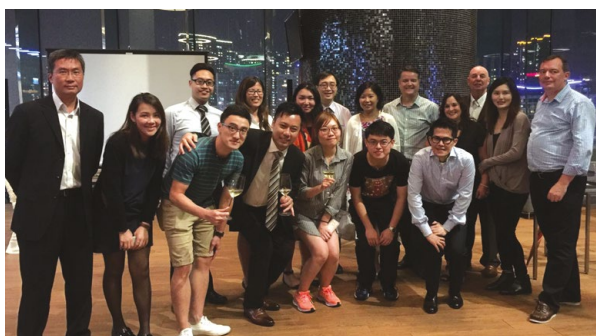
Alumni Night with students and teachers (Sept 2016)