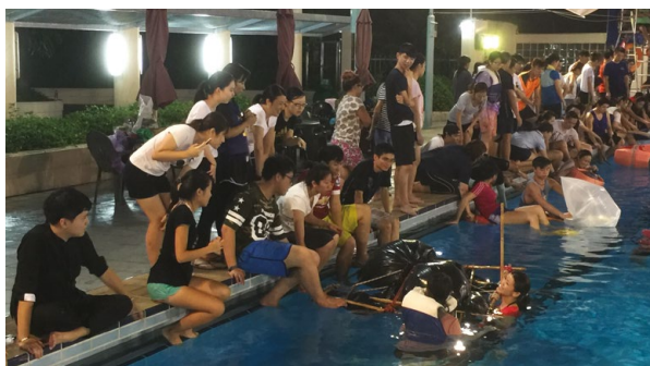
Leadership activity in HKU Flora Ho Sports Centre and Stanley Smith Swimming Pool (Sept 2016)