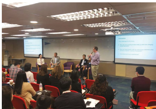
University of Plymouth Day (March 2019)

This hospitality management degree programme is designed to provide a strong vocational theme relevant for a wide range of employment sectors in the hospitality industry. Hospitality embraces a wide range of sectors including: contract catering, hotels, leisure (such as theatres and casinos), licensed retail (pubs and clubs), restaurants and welfare catering. Hospitality continues to be one of the largest growth industries. Its successful management depends on high-quality business skills and the ability to provide consumer satisfaction. This programme aims to equip students with appropriate knowledge and understanding of hospitality and to develop their skills needed for employment or further study.