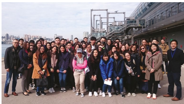
Guided visit to Kai Tak Cruise Terminal (Jan 2018)