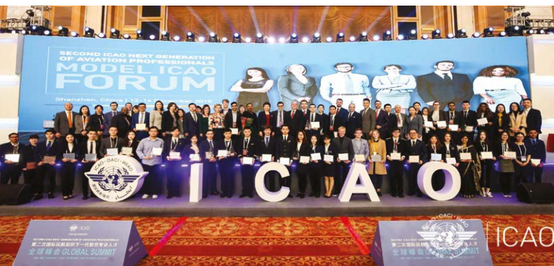
HKU SPACE aviation students are winning team member of the Outstanding Solutions for the Case Study in ICAO model forum

Swinburne University of Technology, Australia CRICOS Provider Code: 00111D