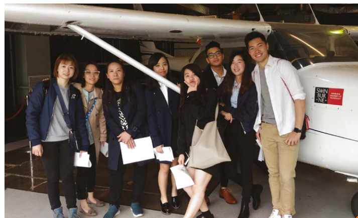
Flight Simulation Practice at Hawthorn Campus, Swinburne University of Technology

* A 'course' in the Hong Kong curriculum is equivalent to a 'unit' in the Australian curriculum.