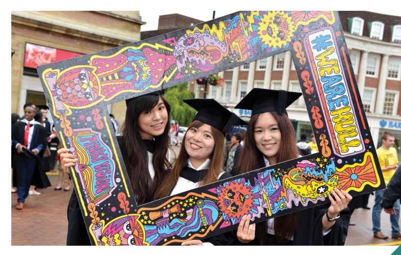
** Face-to-face teaching will convert to online teaching due to COVID-19 pandemic