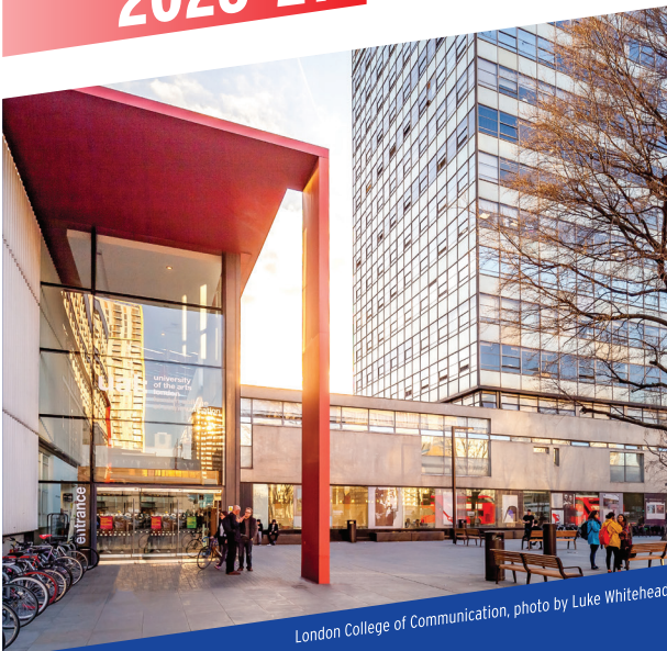
London College of Communication, photo by Luke Whitehead